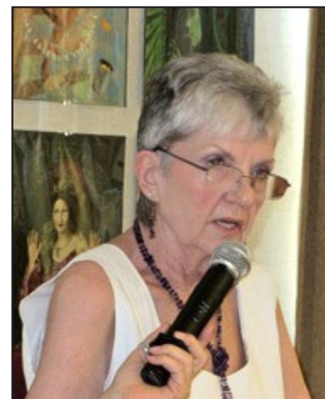
AT THE WOMEN’S VISIONARY CONGRESS.